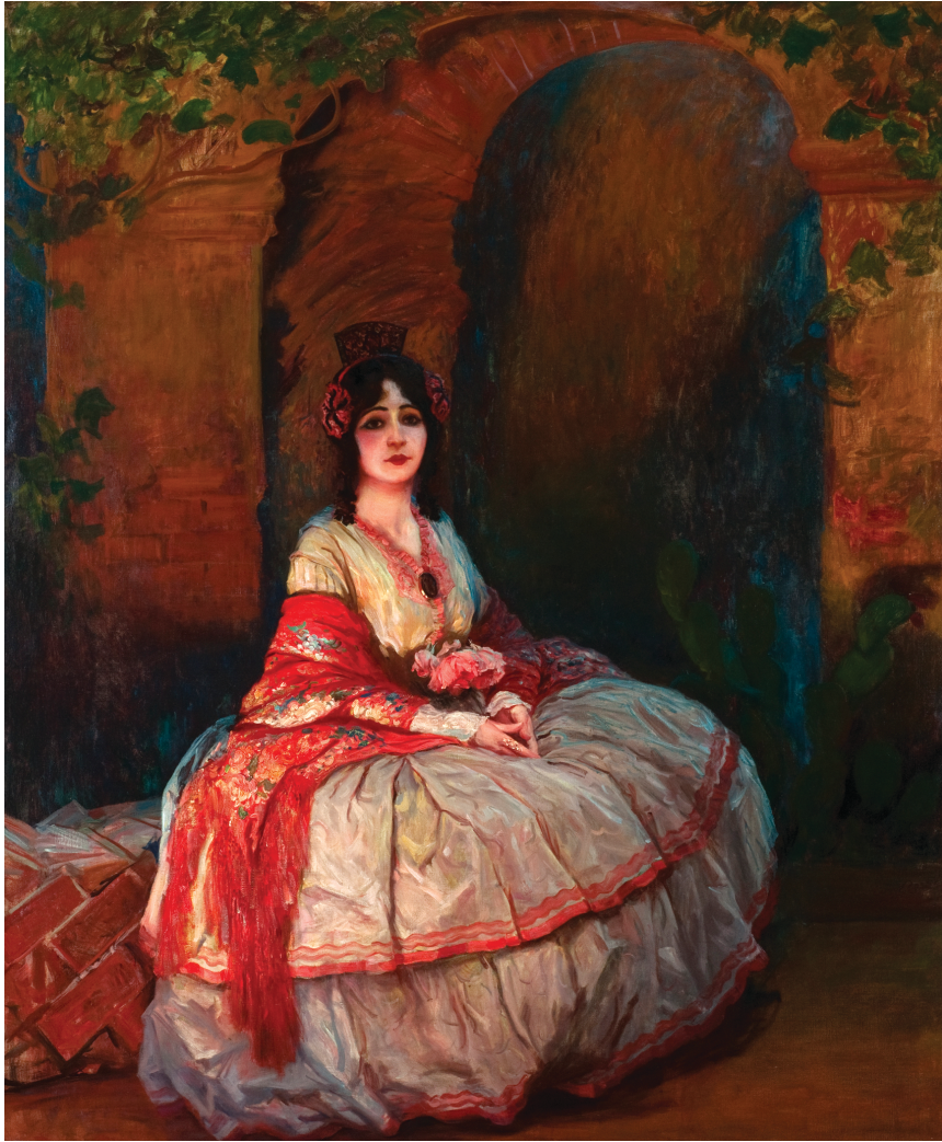
Image: Leading Lady 1915 Guy Rose (American 1867-1925)