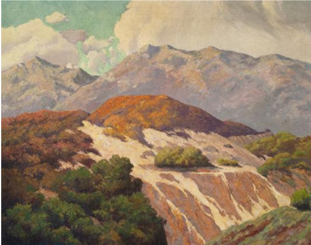
Image: Alfred Mitchell "Mountain Landscape (After Braun)", 1913 Collection of The San Diego Museum of Art, Gift of Elizabeth W. Colburn, 2011.60