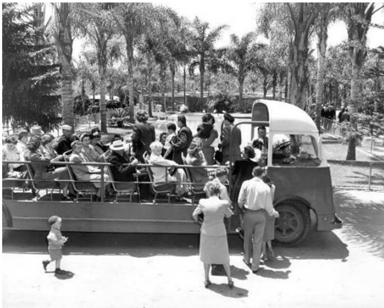
Image: A group of visitors and active service members board one of the San Diego Zoo's tour buses. 1944.