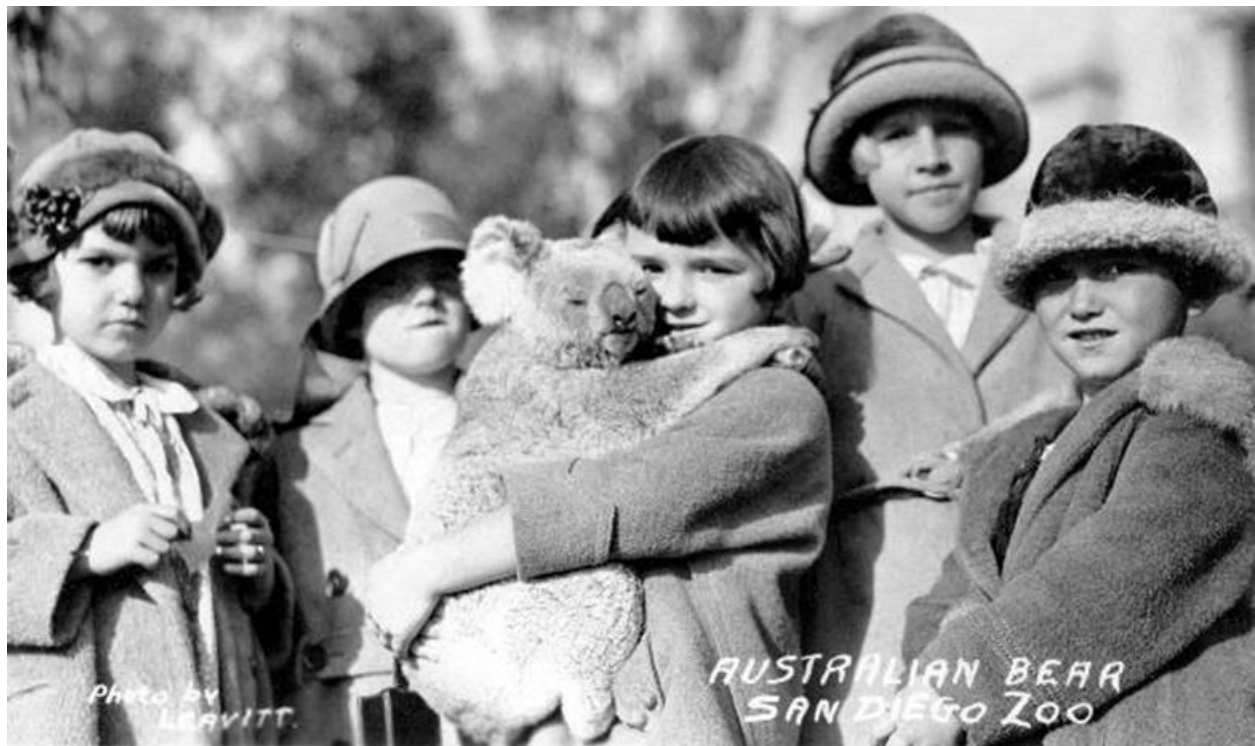
Image: San Diego children with one of the San Diego Zoo's most popular arrivals, the Australian koalas. Two koalas (Snugglepoot and Cuddlepoot) arrived in 1925. The San Diego Zoo was the first zoo in the United States to have koalas in the collection.