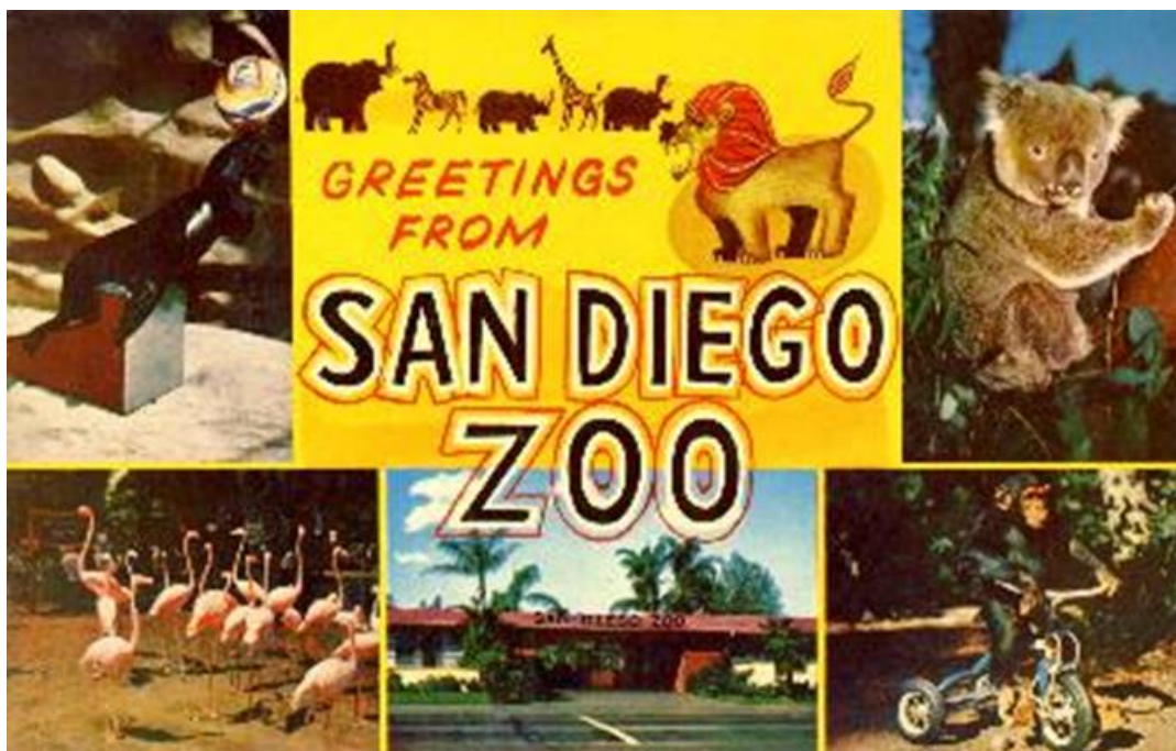
Image: Postcard Circa 1970