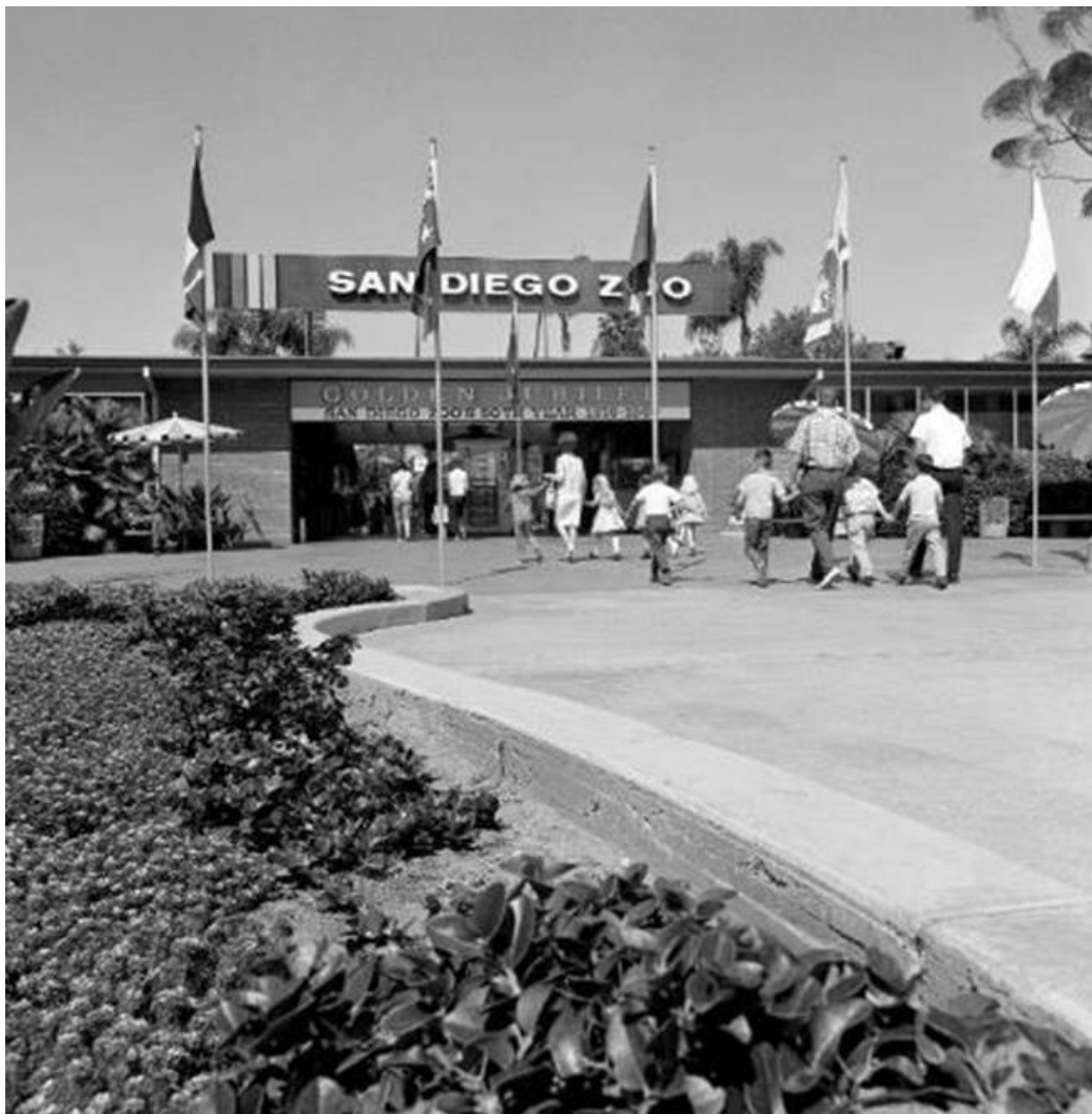
Image: Entrance to the San Diego Zoo during the Zoo's 50th Anniversary "Golden Jubilee" Celebration, 1966.