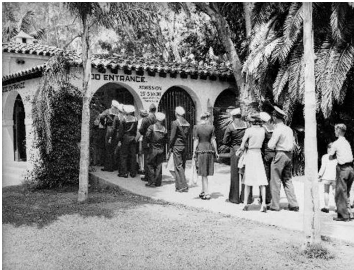
Image: During World War II, the San Diego Zoo became a refuge for military service personnel as a safe and wholesome distraction from war. 1944