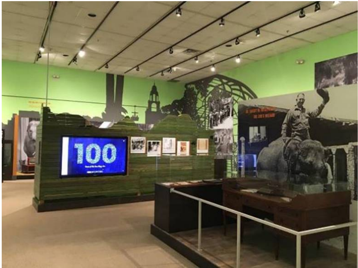
Image: The Exhibition