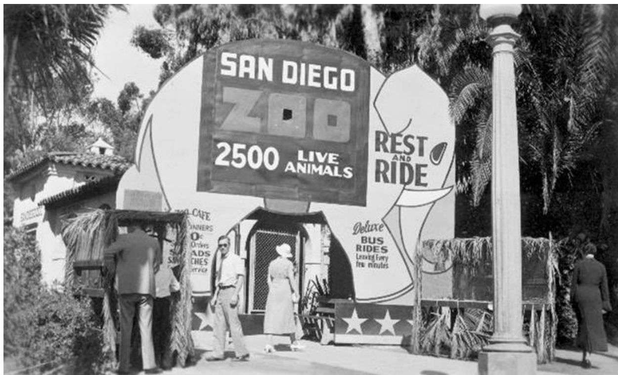
Image: Special entrance to the San Diego Zoo in 1936.