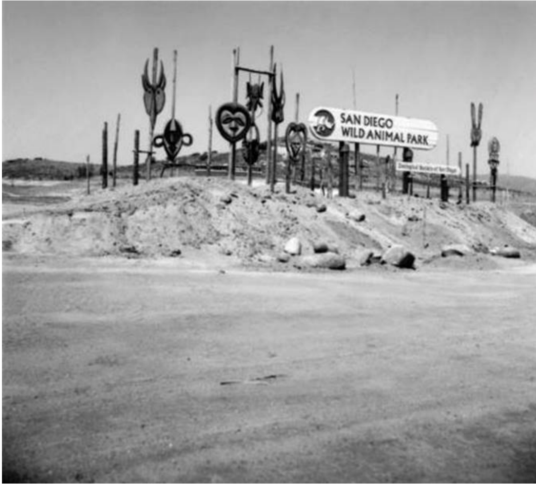
Image: Early entrance of the Wild Animal Park (now San Diego Zoo Safari Park), 1972